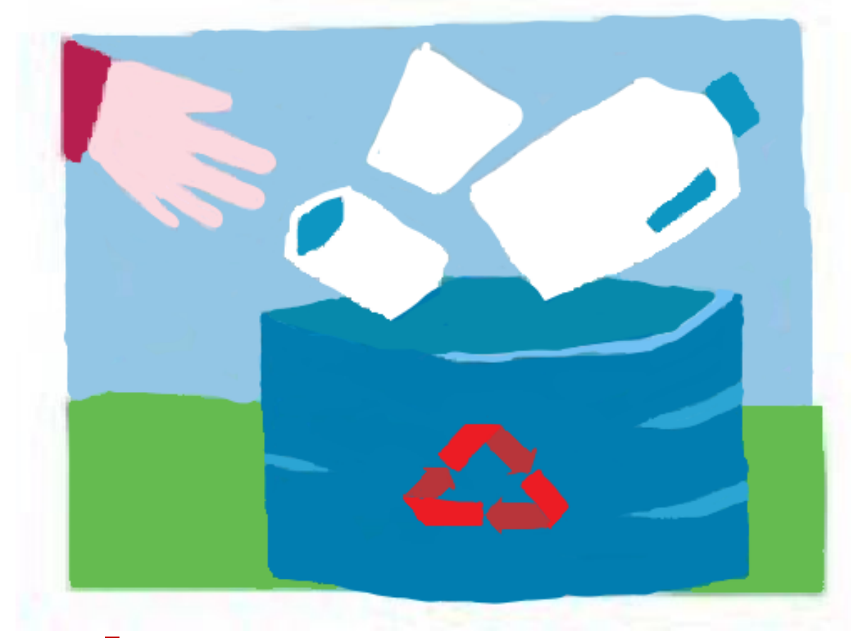
Reduce, Reuse, Recycle