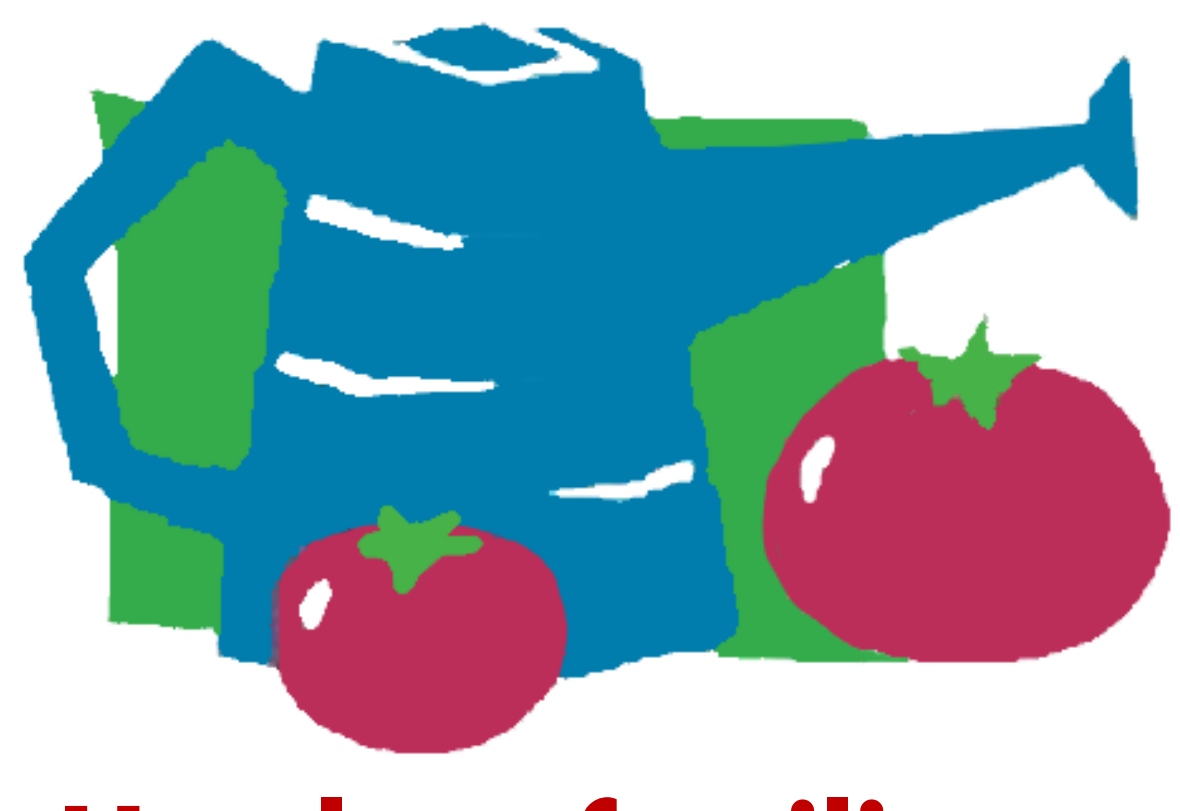
Use less fertilizer